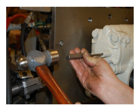
Cylinder Head Autoplunger Resetting

6. Reset AUTO plungers by tapping them in with a 1/4" punch and hammer until you feel the plunger bottom out in the bore. Be careful not to score the plunger bore. Scoring the bore will cause a leak which cannot be repaired. After the AUTO plungers are reset, correctly set them by following steps 2 through 4.