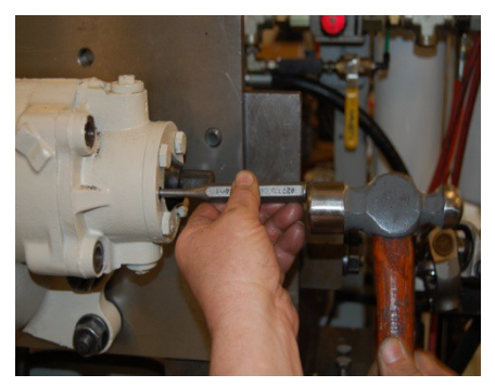
Bearing Cap Autoplunger Resetting

If there is no room to access the cylinder head plunger with the punch and hammer, the autoplunger cartridge can be removed and placed in a vice to reset the autoplunger.