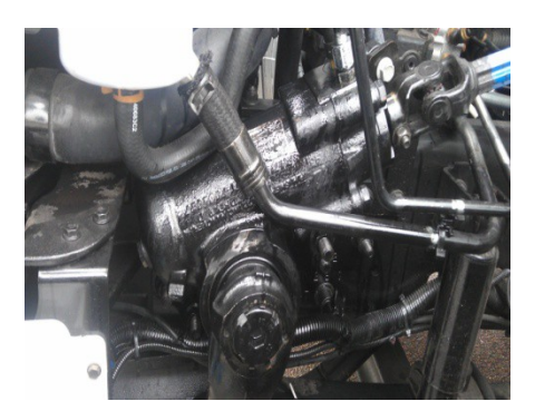
HD94 with Autoplunger cartridge

If there is no room to access the cylinder head plunger with the punch and hammer, the autoplunger cartridge can be removed and placed in a vice to reset the autoplunger.