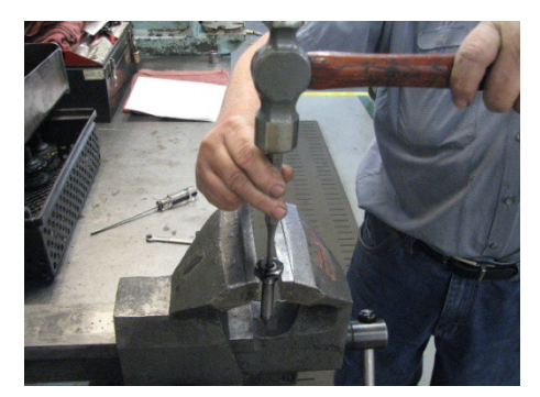
HD94 Autoplunger cartridge in vice

Once the relief plungers are set, no further adjustment is necessary unless tire size or wheel offset is changed.