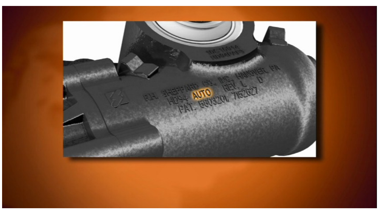
HD94 AUTO Steering Gear

1. AUTO plunger gears are identified by the word AUTO in raised letters cast into the side of the steering gear housing.